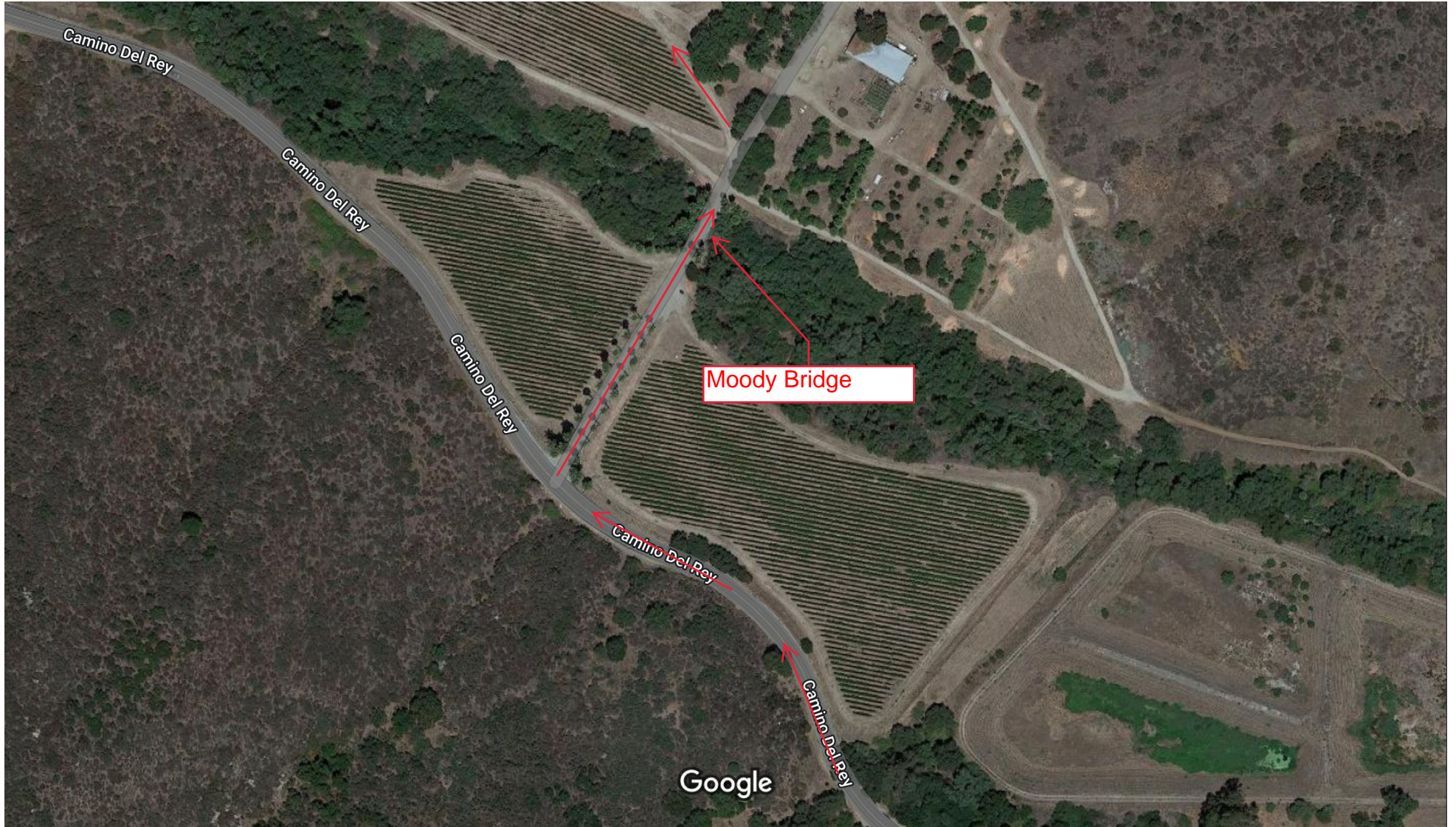
Imagery ©2022 Maxar Technologies, U.S. Geological Survey, USDA/FPAC/GEO, Map data ©2022 100 ft